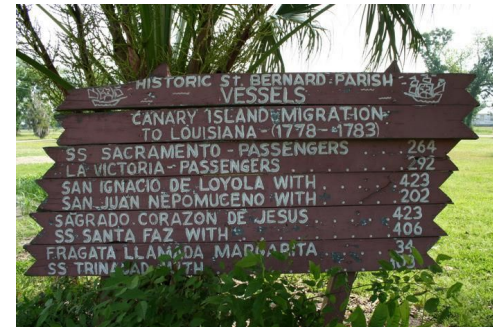
Passenger Boat information sign in St. Bernard Parish