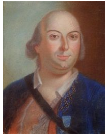
Bernardo de Galvez