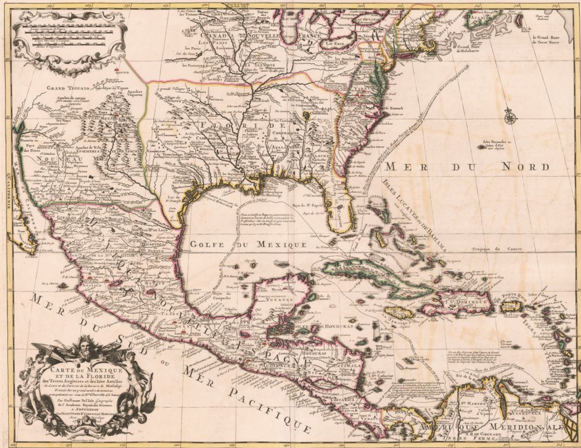
Map of Spanish Colonial Mexico and Florida