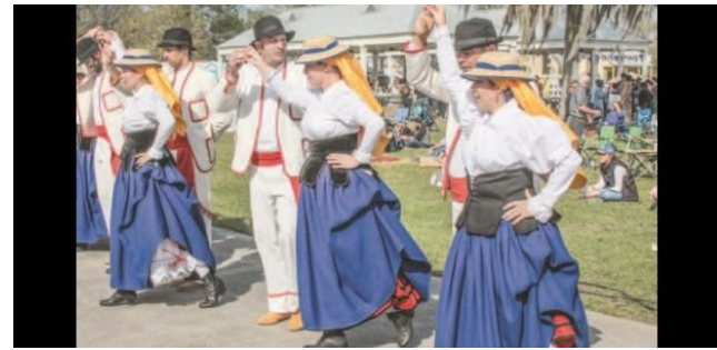
Modern Isleño Festival