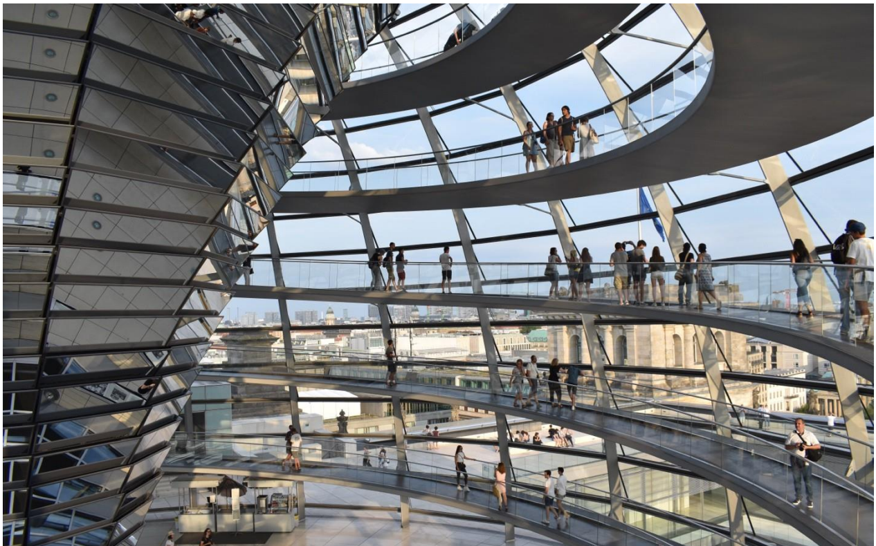
Reichstag Dome in Berlin

Presented by The Historic New Orleans Collection